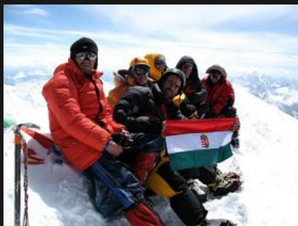
Six Hungarian climbers summited G1 last Sunday. Image courtesy of Nemzeti Sport (click to enlarge).