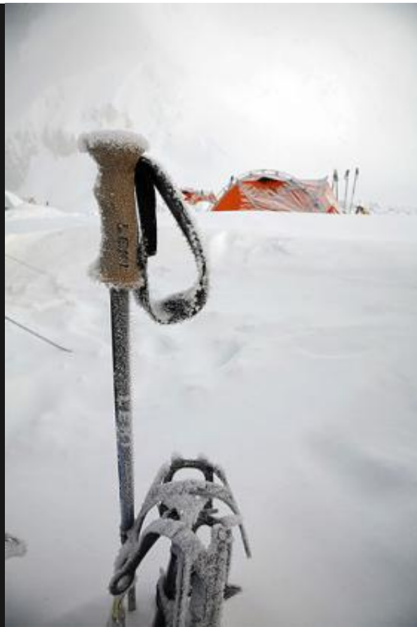
Teams have reported on avalanche risk still high on GII. Image of GII's C2 in the morning frost, courtesy of JamieMcGuinness/Project-Himalaya (click to enlarge).