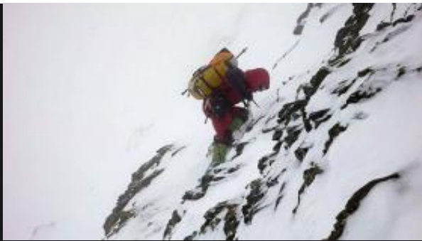
Image of Gerlinde progressing on difficult mixed terrain between C3 and C4 (click to enlarge).