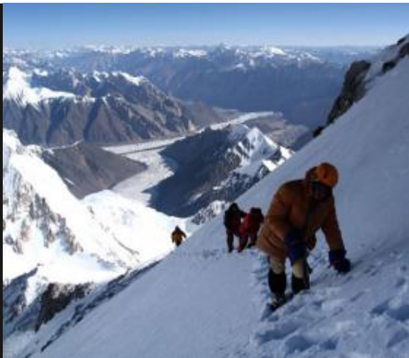
Hungarian climbers at a traverse at 7,700m, toward G1's summit. (click to enlarge).